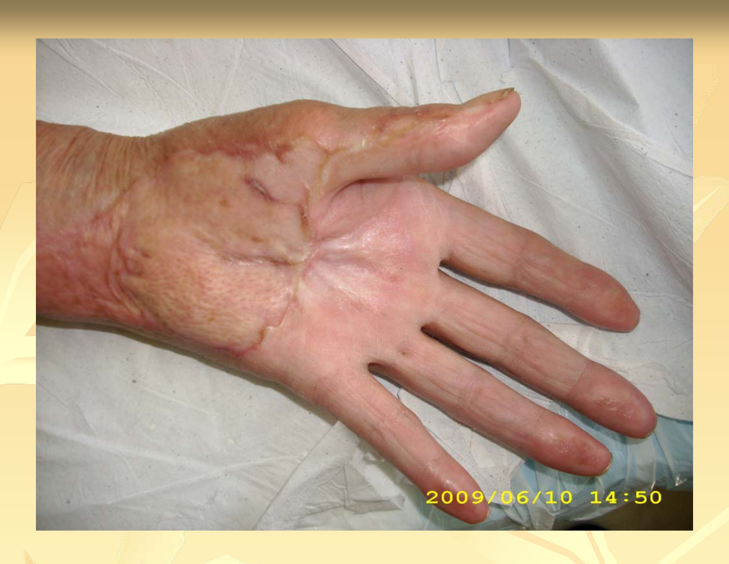
Figure 11: a 4 months follow-up shows good result and an acceptable function despite the star-shaped palmary scar band (for which the patient had a flat refusal concerning the possible surgical repair, telling the plastic surgeon she is very happy with present result).