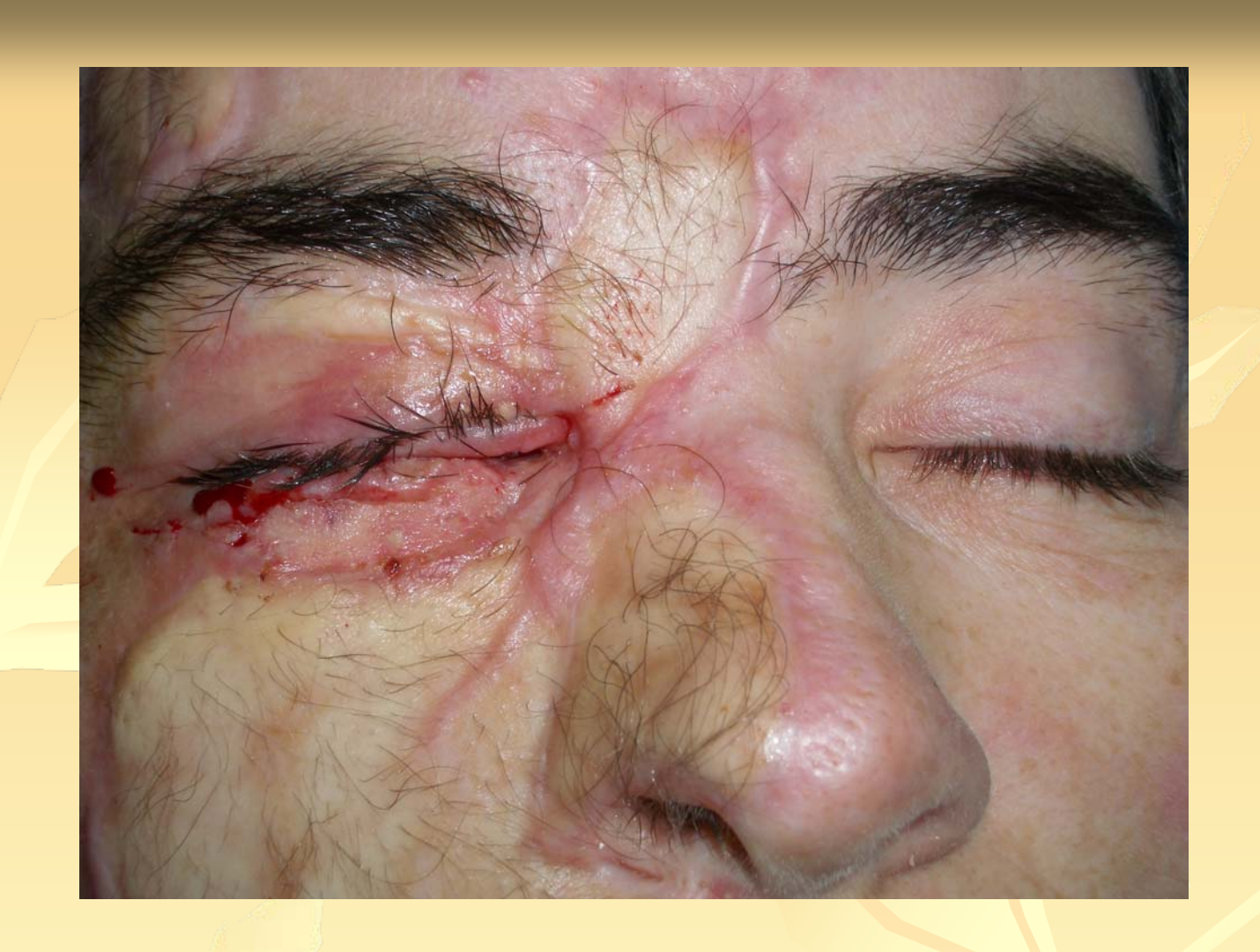
Figure 19: a follow-up after two weeks from the operation shows a complete palpebral occlusion, normal position and orientation of the eyelashes and acceptable dimension of the right eyelid opening.